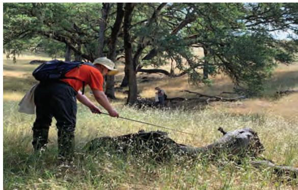
Man versus lizard with a fishing rod.